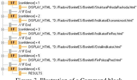
Figure 3. Illustration of a Command block

In the Command Block shown in Fig 3 each selected aspect is associated with the appropriate expert system. Since Corvid systems are run in the browser, it is sufficient to link an adequate .html page to the combination of DISPLAY_HTML command and the path to the .html page.