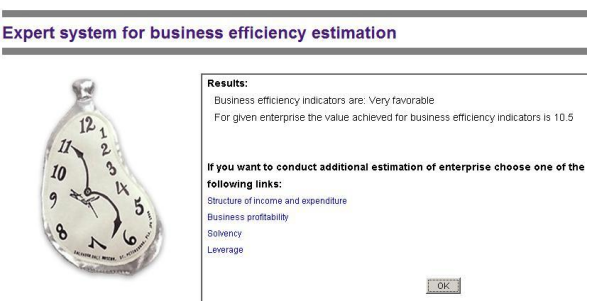
Figure 4. Expert system for business efficiency estimation - the illustration of the results screen

Connecting expert systems in such a way is certainly possible, but extremely complicated in Exsys Corvid, so the recommendation of the provider is to run the system as an application whenever it is possible to read/write data to the local file system. It is possible to achieve this goal from an applet, but that would require a server-side program to read/write the data on the same server. This is due to Java security restrictions.