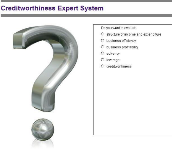
Figure 2. Selection of the desired aspect to be analyzed

In the Command Block shown in Fig 3 each selected aspect is associated with the appropriate expert system. Since Corvid systems are run in the browser, it is sufficient to link an adequate .html page to the combination of DISPLAY_HTML command and the path to the .html page.