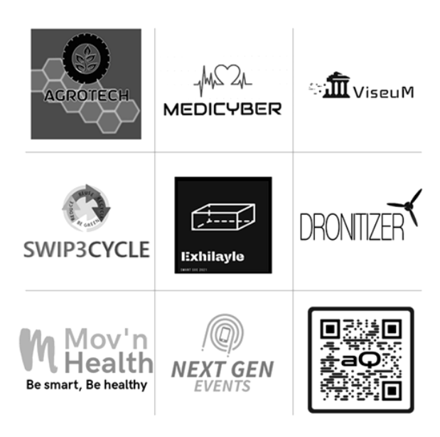
Figure 4: Start-up logos (2021)