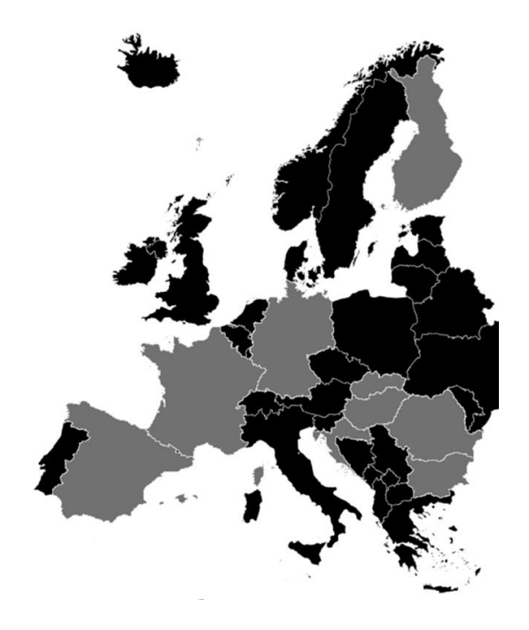
Figure 1. SmartSoc project – participating countries

The project consortium was created by 12 institutions as mentioned in the introduction (Figure 1 and Table 1).