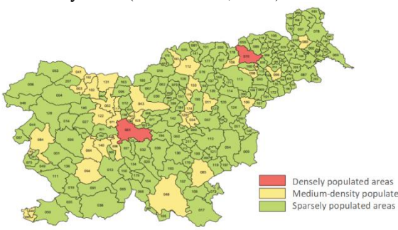
Figure 1 Urbanization rate in Slovenia

The settlement structure in Slovenia is highly polycentric. The population density is 101.7 inhabitants per km<sup>2</sup>. Since the eighties of the last century, the share of the urban population in Slovenia has not exceeded 50% of the population. The projection of the United Nations predicts that it will rise to 61% by 2050 (Albino et al., 2015).