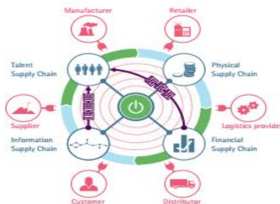
Figure 2. Advantages of digital supply chain

According to Fig. 2 ( Saideep, R., & Aditya, S. 2014) one of the greatest advantages of cloud technology lies in the fact that it makes digital supply net extremely connected and therefore whole supply chain becomes very visible for all participants. Visibility is key factor in whole supply chain management and it makes whole buyer net more transparent. Systems based on cloud technology contribute to visibility of delivery in real time and improve logistic management.