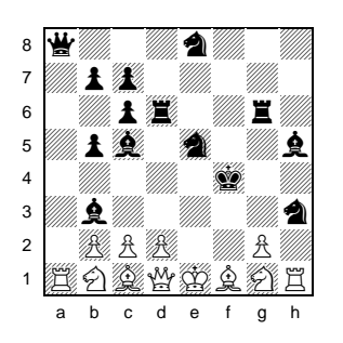
Figure 4. Position after the 32th move of white. How did the game go?

There are several computer programs for solving (shortest) proof games but there is no scientific paper in this field. Euclide [7] and Natch [29] are the most well-known programs which are free to download and easy to run. Brief descriptions can be found on their websites. Euclide and Natch have fairly complex built-in algorithms and will not be described in this paper. However, in Fig. 4 we present a problem which can be solved by both programs [32].