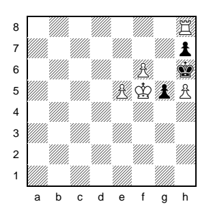
Figure 5. White to mate in two moves.

As already said in Section 2, classical chess problems (e.g. Mate in two moves) are most often given without information about whether players can castle or can en passant capture the opponent's pawn. A simple example of such problem, published in [14], is shown in Fig. 5.