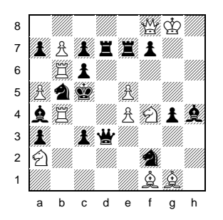
Figure 3. Mate in two moves.

According to some authors, retrograde chess analysis had been unknown to players around thousand years ago [33]. But, the precise year or even decade of the discovery of retrograde chess analysis is unknown. However, its occurrence can be naturally linked to the appearance of needs for proof of legality of positions given in classical chess problems (e.g. Mate in two moves) published in chess and other publications. The validity or invalidity of the given chess position is often possible to prove only with the help of retrograde chess analysis. In particular, this applies to chess positions published before the development of such analysis. It was noticed that some of published problems have illegal position, which is not allowed according to the Codex for chess composition [26]. A good example is shown in Fig. 3 [32].