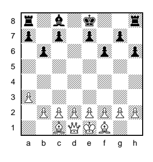
Figure 10. It is black's move. Can black castle?

described in 1986 [1], [2]. Similarly as Filman, the authors focused on the difficult semantic problems such as Smullyan's problem [21], shown in Fig. 10.