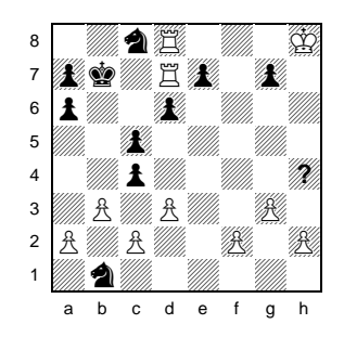
Figure 9. A piece has fallen off of the chessboard from the square h4. What piece was it?

To solve this problem, Filman created a first order logic formal deductive system in programming language LISP. This system was then extended to include some observational facilities. Namely, Filman stated [9] that generally intelligent systems needs to reason not only by deduction but also by other schemes such is induction, analogy and by immediate recognition of results , a process we identify as observation . For example, observations are inferences of the form "Black is in check" while deductions are inferences of the form "Both sides can't be in check at the same time, black is in check, therefore white is not in check". So, Filman concluded that problem showed in Fig. 9 requires both deductive and observational inferences.<sup>3</sup>