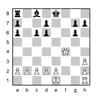
Figure 6. White to mate in three moves.

If we assume that white can castle, then the white queen on f4 was promoted and retrograde analysis reveals that black cannot castle (the promoting white pawn from f2 must have disturbed the black king). On the other hand, black can castle only if the white queen on f4 was not promoted so if white cannot castle. This leads to problems because while neither white castling nor black castling can be shown not to be legal, white and black castling cannot both be legal. For these reasons, Codex was extended with the following two rules: