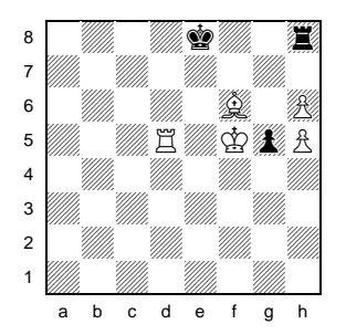
Figure 7. White to mate in two moves.

In the following example, published in [13] and shown in Fig., 7, application of the rule (3) is illustrated.