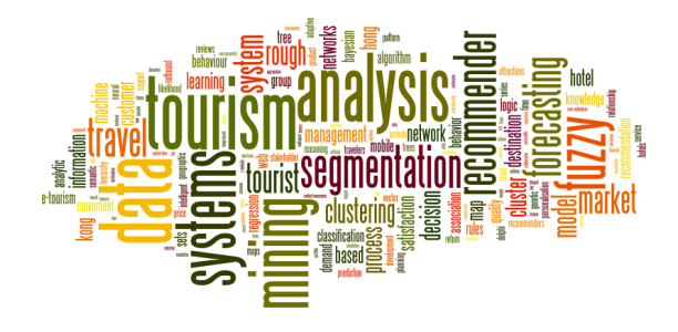
Figure 3: Visualization of keywords since 2006

Figure 3 depicts the visualization of keywords in papers published since 2006. The most important keywords here were: tourism, segmentation, analysis, systems, data, mining, fuzzy, forecasting, travel, and recommender.