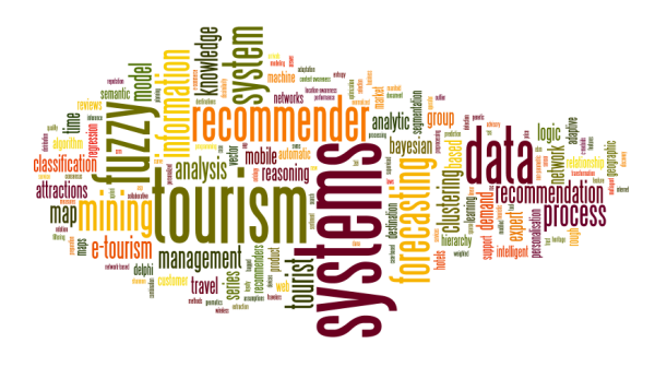
Figure 4: Visualization of keywords in ICT related publications

These two depictions allow us to conclude that there was a shift in research in the observed intervals regarding to technology. Whilst in the former neural networks seem to be the important mainstream approach, in the latter approaches and recommender systems seem to be a surface. In both intervals tourism, data/information mining, forecasting and segmentation play an important role.