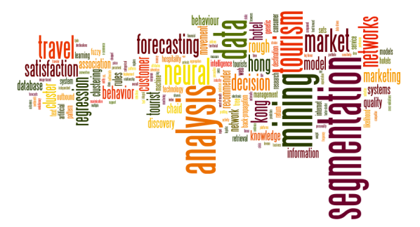
Figure 5: Visualization of keywords in tourism related publications

The visualization of keywords in tourism related publications on the other hand is quite different (Figure 5). Here the most important keywords include: segmentation, analysis, mining, tourism, and data.