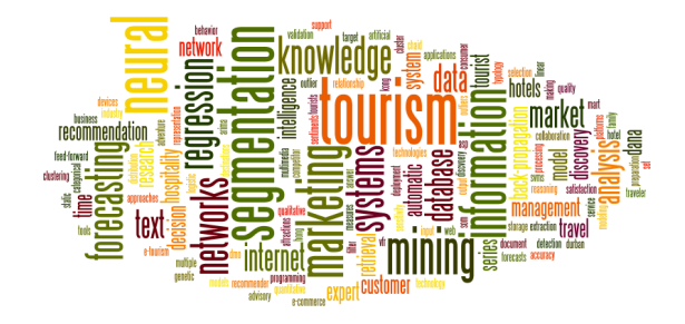
Figure 2: Visualization of keywords until 2005

The first visualization is depicted in Figure 2. From the image one can conclude that the most important keywords in papers published prior to 2005 were: tourism, segmentation, neural, information, mining, marketing, networks and forecasting.