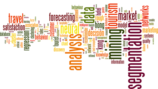
Figure 5: Visualization of keywords in tourism related publications

The visualization of keywords in tourism related publications on the other hand is quite different (Figure 5). Here the most important keywords include: segmentation, analysis, mining, tourism, and data.