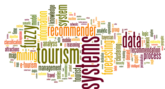
Figure 4: Visualization of keywords in ICT related publications

These two depictions allow us to conclude that there was a shift in research in the observed intervals regarding to technology. Whilst in the former neural networks seem to be the important mainstream approach, in the latter approaches and recommender systems seem to be a surface. In both intervals tourism, data/information mining, forecasting and segmentation play an important role.