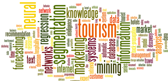
Figure 2: Visualization of keywords until 2005

The first visualization is depicted in Figure 2. From the image one can conclude that the most important keywords in papers published prior to 2005 were: tourism, segmentation, neural, information, mining, marketing, networks and forecasting.